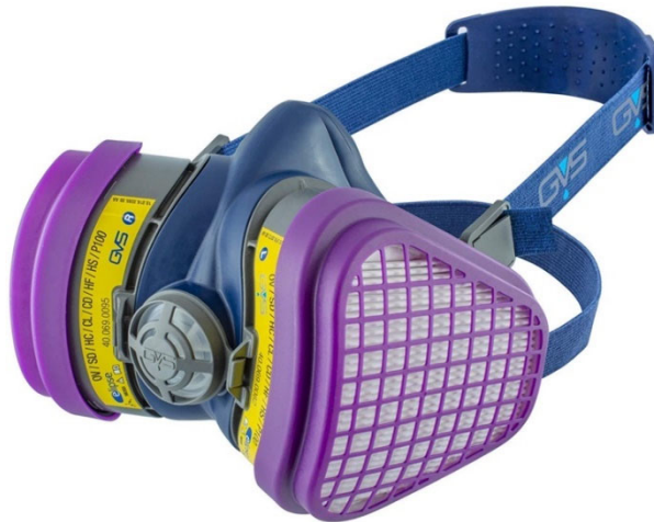
Figure 3. An example of reusable TC-84A respirator with fitted filter.

Pest management professionals can improve their understanding of respirators by reviewing the information provided by the Pesticide Education Resources Collaborative (PERC) who have placed clear explanations on all aspects of respirator use for pesticide handlers in English and Spanish: http://pesticideresources.org/wps/definitions/respirator.html .