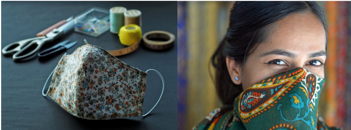
Figure 5. Consider making your own face masks (left) or utilize regular scarves (right), bandanas, and other clothing (similar to ideas shown in photos).

Use cloth face coverings to help slow the spread of COVID-19 (Figure 5). Face coverings will reduce the number of droplets released into the air as a person exhales, speaks, yawns, sneezes, or coughs, and will also reduce the wearer's ability to stick their fingers in their nose or mouth. The CDC reports that a washing machine can be used to properly wash face coverings.