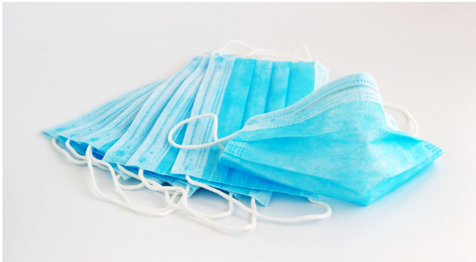
Figure 4. Disposable face masks (surgical face masks).

If you are not a healthcare worker or a patient under care, please use face covers that are not medical grade devices while supplies are needed for medical use.